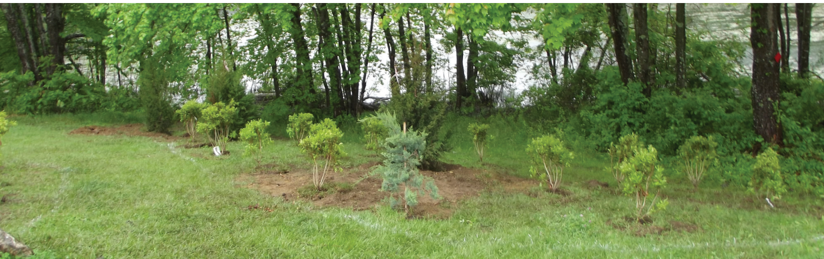
Riparian buffer installation in the Niantic River watershed.